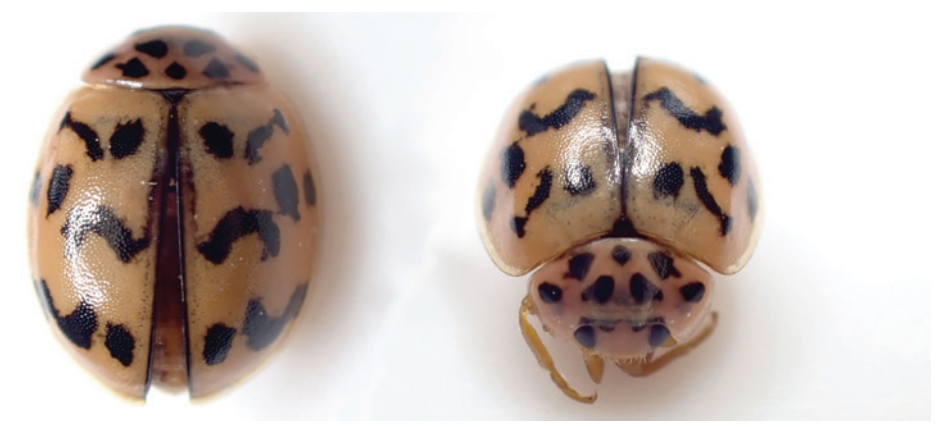
Figure 2. Oenopia doublieri (Mulsant, 1846) from Neum collected on 28 February 2020.

Slika 1. Najdišči Oenopia doublieri (Mulsant, 1846) – krog, in Novius cardinalis (Mulsant, 1850) – trikotnik, v Bosni in Hercegovini.