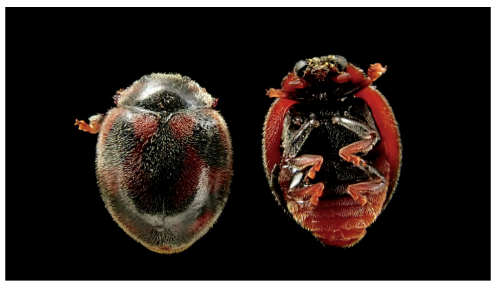
Figure 3. Novius cardinalis (Mulsant, 1850) from Neum collected on 19 October 2021.

The discovery of these two species in Bosnia and Herzegovina is not unexpected, particularly in the Mediterranean region of the country. Nevertheless, it is significant